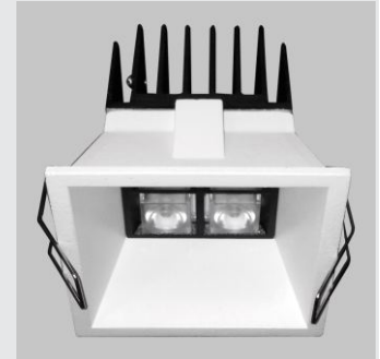
Cat. No : NL 1444