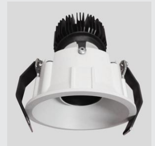
Cat. No : NL 1446